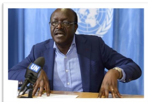
Dr. Mukhisa Kituyi tweets in support of small businesses on the occasion of the MSME day, 25 June 2020.