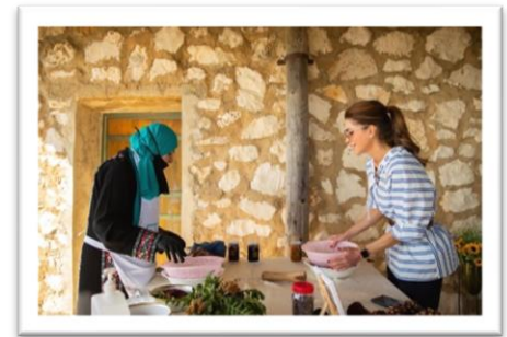
Queen Rania Al Abdullah visits the Empretec graduate’s restaurant in the governorate of Ajloun.